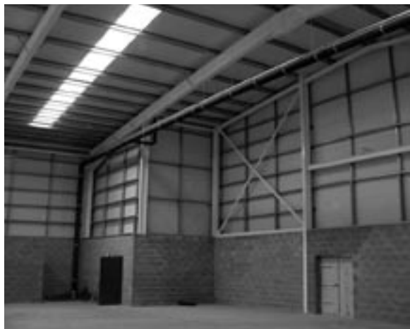
Siphonic system running across building at high level to single discharge point

One key point to remember is that all systems 'self-prime' and that there are no essential differences in technology between the various manufacturers.